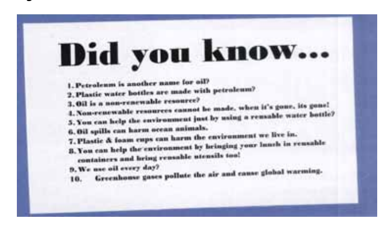
Figure 1. Poster to Educate Others About Plastic Use

There are many other science concepts from NGSS that can be addressed through environmental service-learning. For example, LS4.D is about biodiversity and humans, and focuses on the central questions: What is biodiversity, how do humans affect it, and how does it affect humans? Environmental service-learning can be used to address College, Career and Civic Life (C3) standards from dimension 4, taking informed action such as D4.7 (grades 3-5): Explain different strategies and approaches students and others could take in working alone and together to address local, regional, and global problems, and predict some possible results of their actions (National Council for the Social Studies, 2013). Language arts and mathematics standards can also be taught and applied within a service-learning unit.